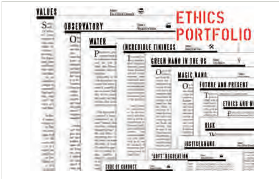
Figure 1: The Ethics Portfolio