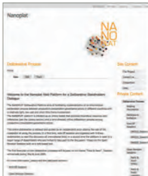
Figure 1: Beta version of the Nanoplat online deliberative platform

Again as discussed above, this tool allows the engagement of larger numbers and a wider variety of stakeholders in order to review and agree on a synthetic consensus statement as an output of the deliberation.